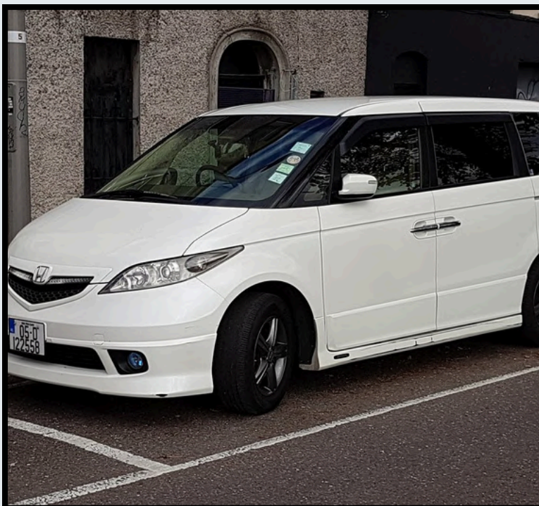
GROUP UPTO 5 ADULTS: SUV WITH DRIVER CUM GUIDE