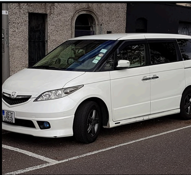
GROUP UPTO 5 ADULTS: SUV WITH DRIVER CUM GUIDE