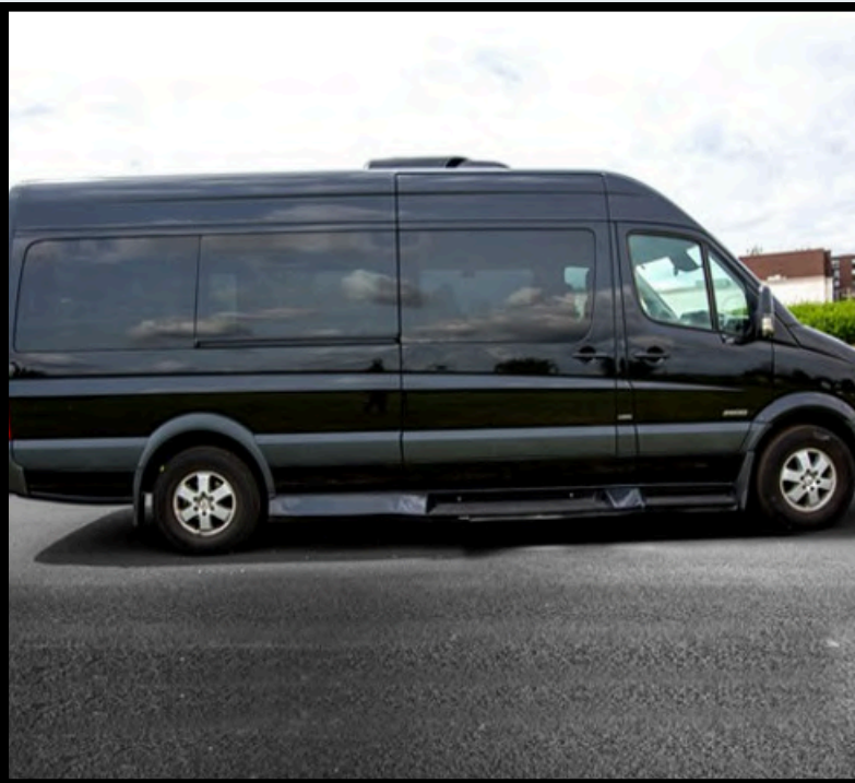
GROUP OF 8- 16 ADULTS: MINI-BUS WITH DRIVER AND GUIDE