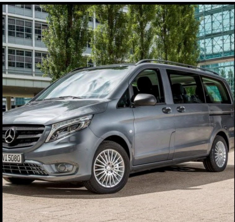
GROUP UPTO 7 ADULTS: MINI-VAN WITH DRIVER CUM GUIDE