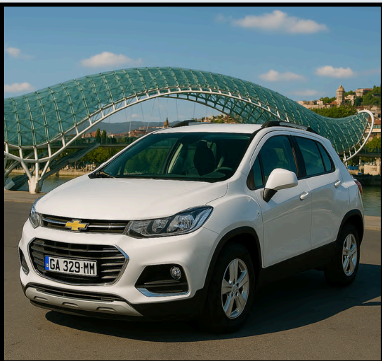
GROUP UPTO 3 ADULTS: SEDAN WITH DRIVER CUM GUIDE