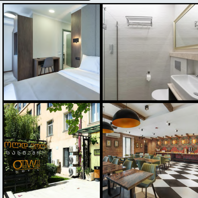
HOTEL OLD WALL TBILISI