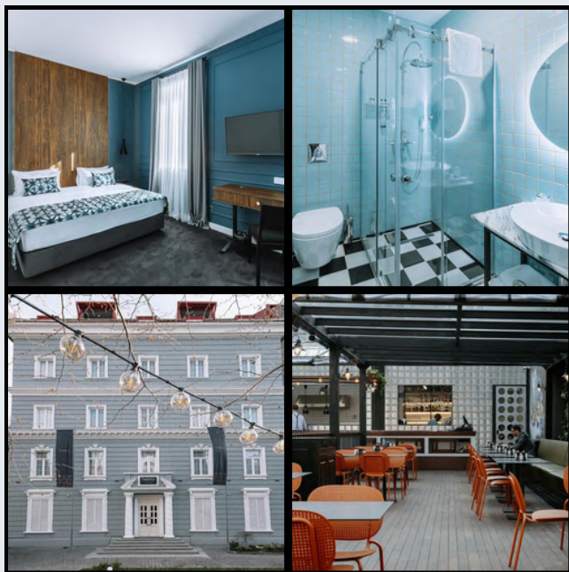
TWENTIES HOTEL TBILISI