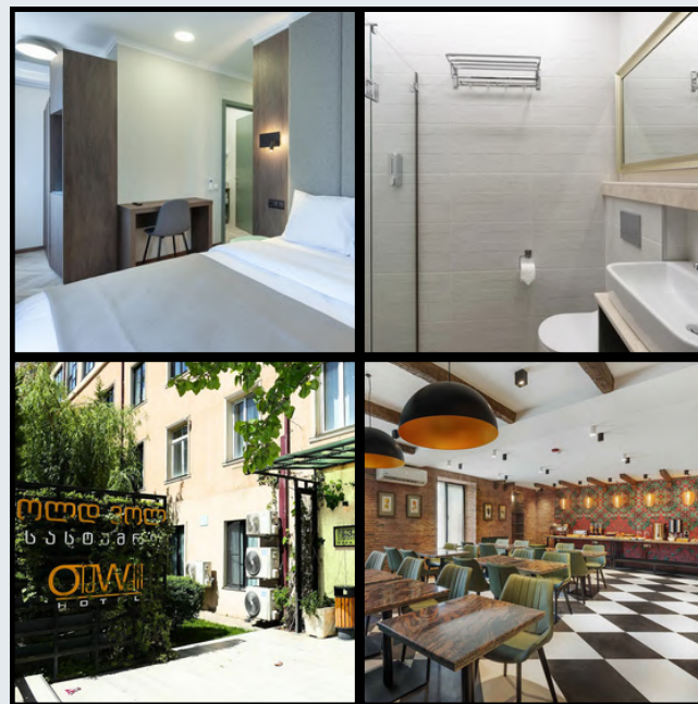
HOTEL OLD WALL TBILISI