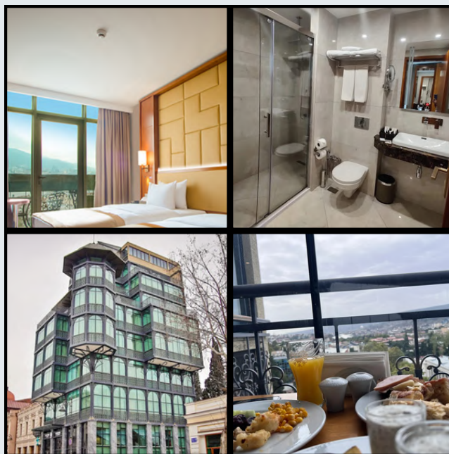
NEW TIFLIS HOTEL TBILISI