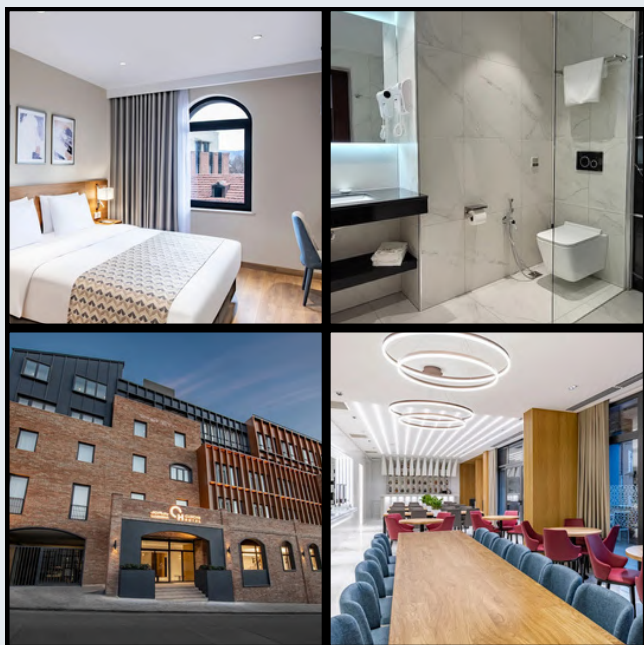
CLOCKS HOTEL TBILISI